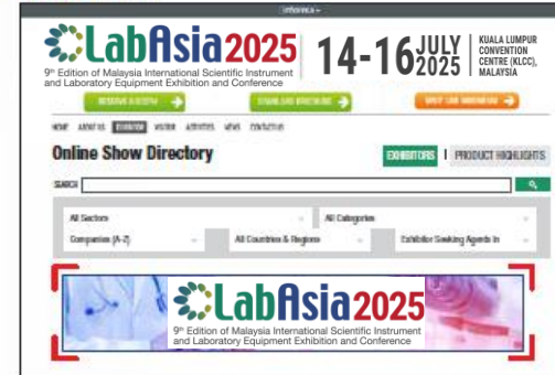
Priority Placement (Exhibitors / Product Highlights)